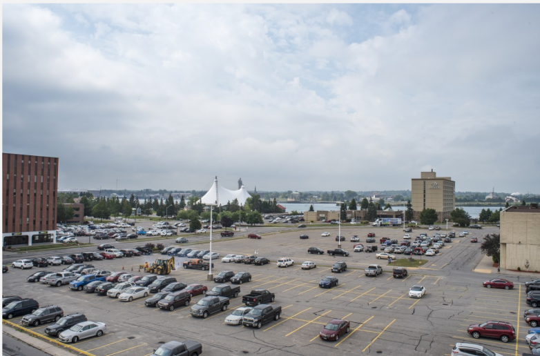
SOUTH-EAST (STATION MALL PARKING)