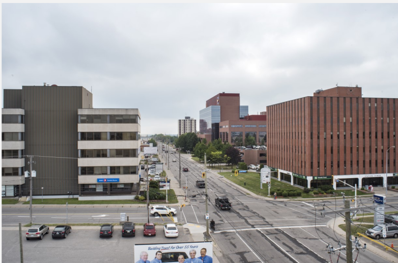
EAST (OFFICE BUILDINGS)