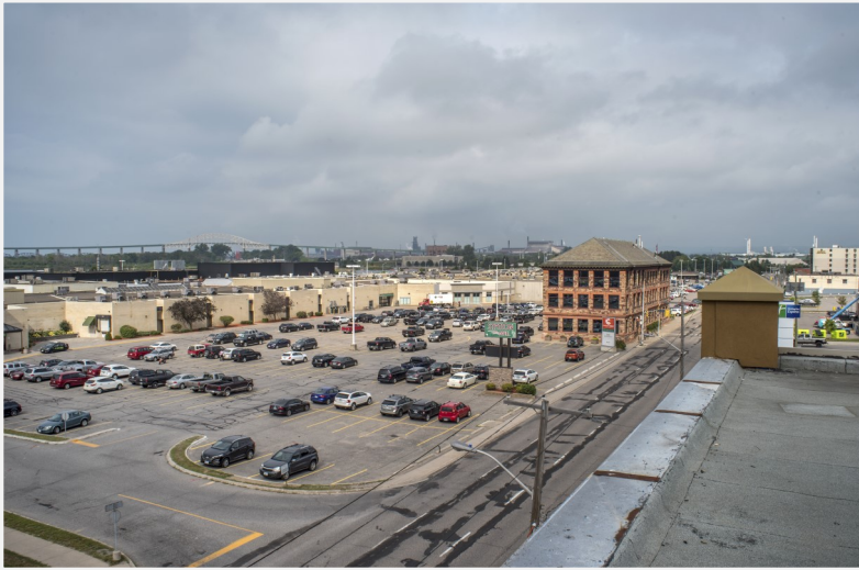
SOUTH-WEST (STATION MALL)